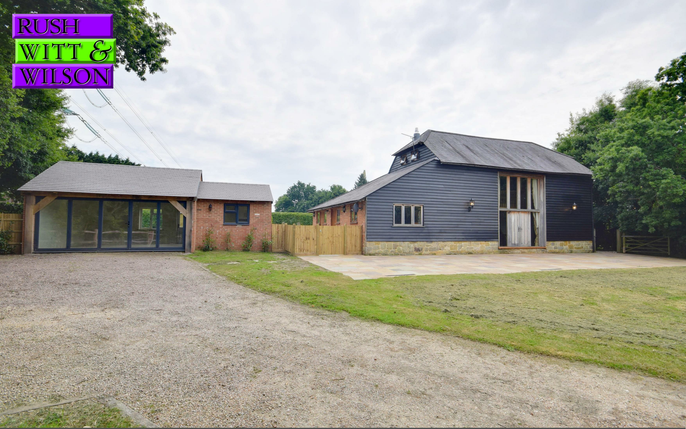
Spelland Barn, Goatham Lane, Broad Oak, East Sussex, TN31 6EY. £945,000 Guide Price.